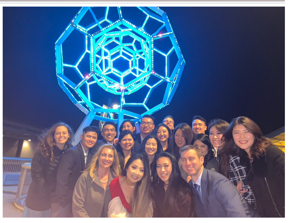
February 22, 2020 | UCSF Formal at the Exploratorium

Q: If you were not pursuing pharmacy, what would you be doing?