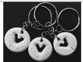
"Chill Pill" keychains were 3D printed at the Makers Lab in the UCSF Library for a fundraiser.