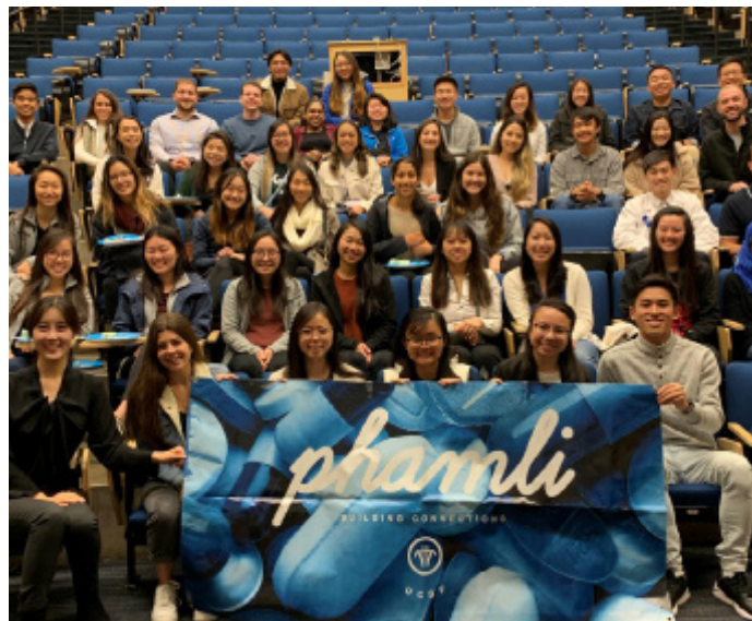
Mentors and Mentees who attended PhAMLI's fall kick-off day

PhAMLI opened the 2019/2020 school year with our highly anticipated mentorship kick-off day. Mentees from UC Davis, UC Berkeley, and San Jose State University came to UCSF to be matched with a current UCSF SOP student. Mentorship through PhAMLI is a valuable relationship where prospective pharmacy students can gain more information not only about the field of pharmacy, but how day to day life is for a current pharmacy student. In addition to mentor matching, PhAMLI set up a current student panel to give mentees more information on day to day pharmacy school life. We are so thankful for the mentors who dedicated their afternoons to meet their mentees, and be part of a valuable mentorship relationship.