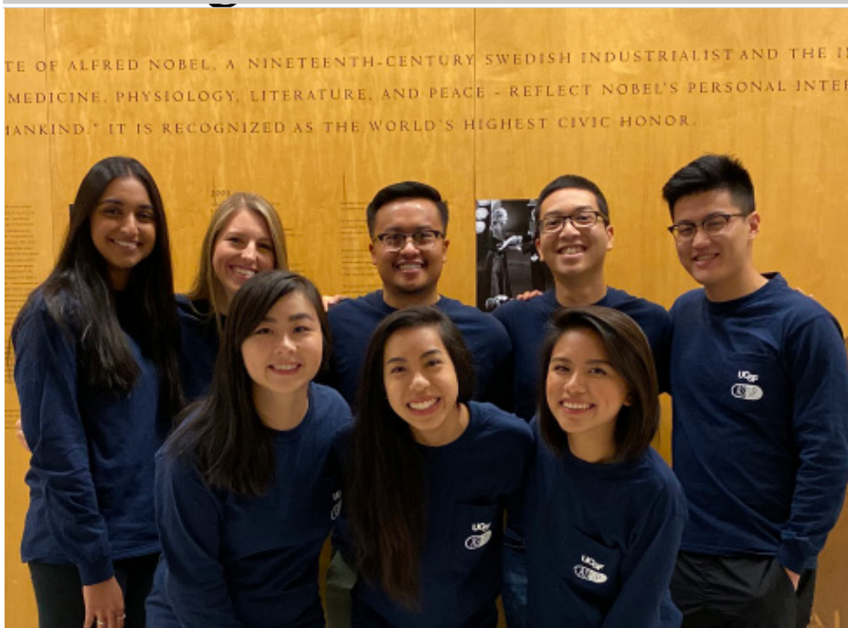
ASSP Board 2019-2020