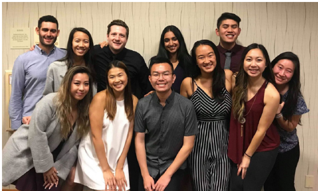
KY Brothers attending Province

The brothers of Kappa Psi have been quite busy this Fall as we welcome our pledges to our Fraternity. To kick off Pledge Season, brothers organized Hangouts where pledges were able to sign up for classic San Francisco activities and bond with their future brothers. Hangouts locations included Dolores Park, Spark Social, Angel Island, and many more!