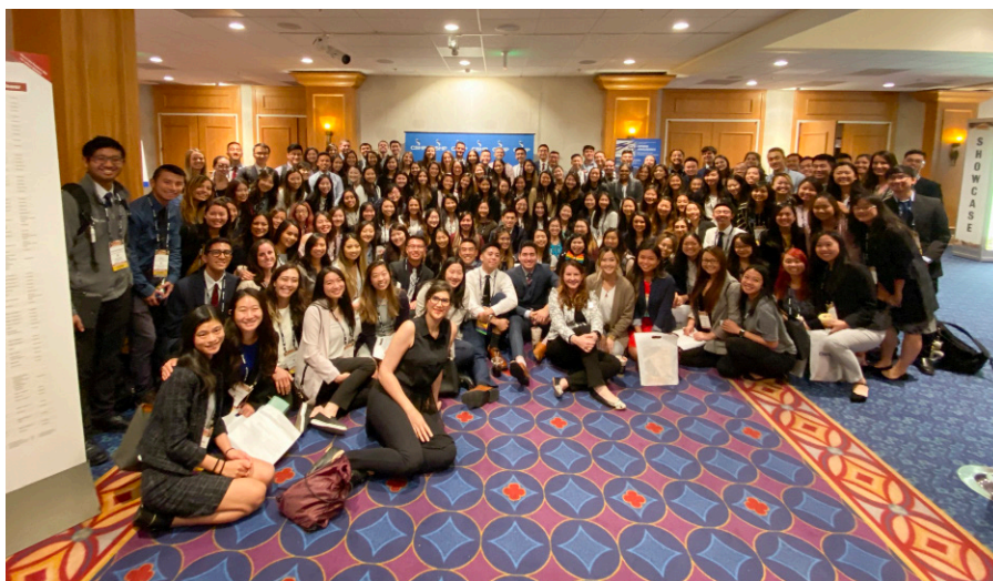
UCSF students at CSHP Seminar 2019

CSHP at UCSF has had a very exciting quarter as we attended CSHP Seminar 2019 and hosted two of our biggest events, Residency Roundtable and our Internship Night in collaboration with APhA-CPhA. CSHP Seminar 2019 took place from October 17-20 at the Disneyland Resort in Anaheim. UCSF had a large presence at Seminar with a record attendance of over 200 students! Overall, CSHP Seminar 2019 was a valuable and fun experience for students as they attended various clinical pharmacy practice sessions and networked