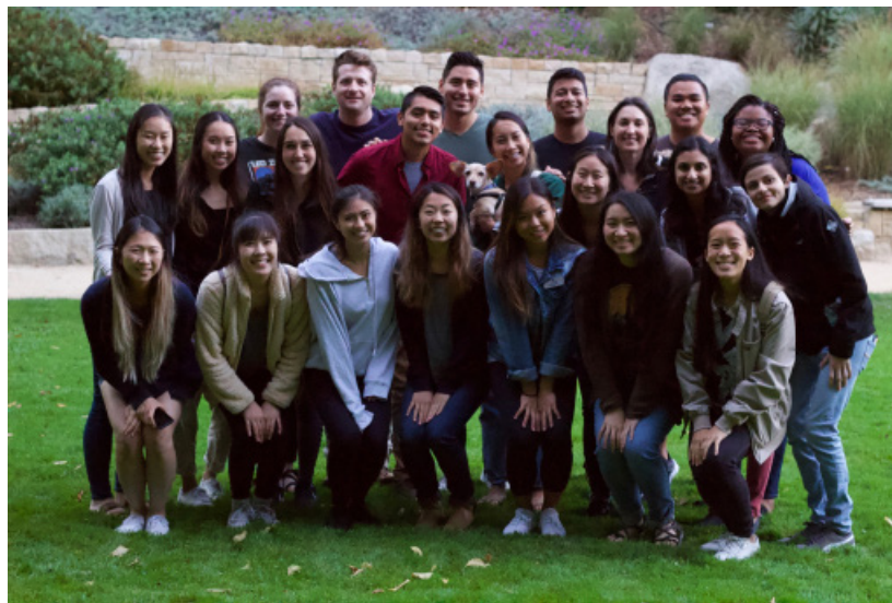
Campus leaders get together for an evening of bonding and activities!

We had a wonderful time meeting students interested in joining our organization at our Information Session and Meet and Greet events. Our Info Session included a presentation about PLS and the application process. Our Meet and Greet event allowed potential candidates to meet current members. It took place at Spark Social where people came out to make s'mores, grab a bite from the food trucks, and socialize!