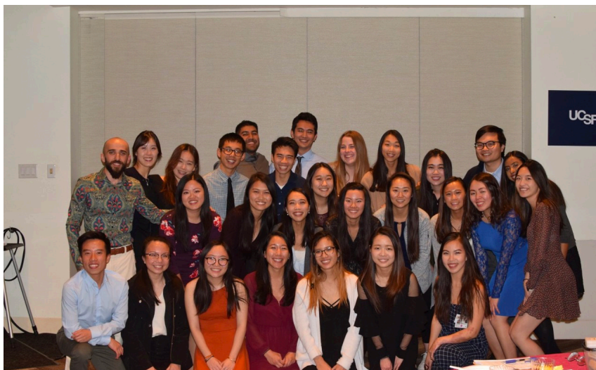
The Phi Delta Chi Zeta Chapter 2019-2020 Candidate Class at our annual Thanksgiving Dinner

Since this event was near Halloween, we celebrated by dressing up in costumes and having a haunted house decorating contest. In November, we also had our annual Thanksgiving Dinner where candidates, brothers, and alumni all gathered for a nice night of eating and mingling. Finally, we wrapped the quarter up with our annual Big-Little Reveal! Candidates were spoiled and given hints all week leading up to the event, and they finally learned who their Bigs were at the reveal.