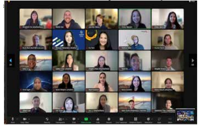
A shot of our students and professionals from Fall Roundtable!

Looking ahead, watch out for our annual winter banquet, where we will hear from the 2022 winning P&T team and provide more