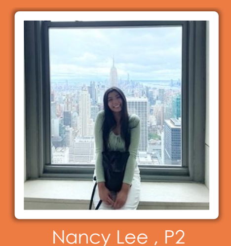
I'm pictured with the New York City view at the Rockefeller Center!